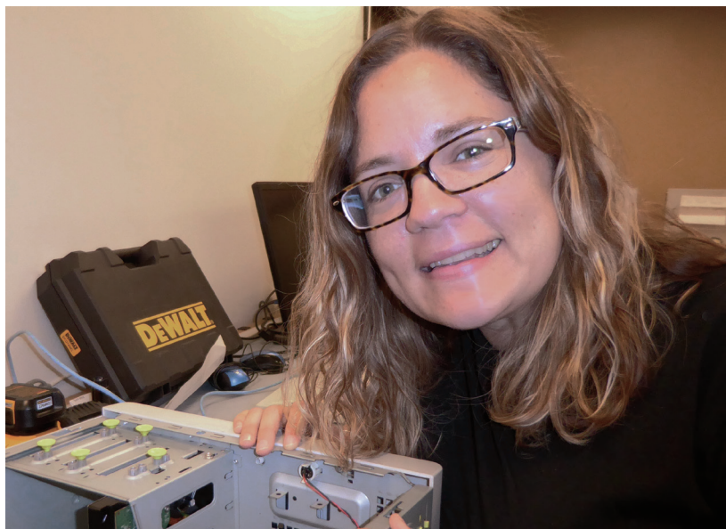
For a complete list of program fees, see page 49

Students prepare for the CompTIA A+, CompTIA Network+, and CompTIA Security+ certification exams. These internationally recognized industry certifications serve as benchmarks that show expertise and proof of mastery of the latest technologies in the information technology field.